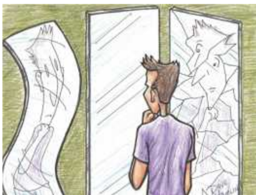
How Did We Get So Out of Whack?

Consequently, both dig in their heels and nothing gets created. You may know people who do this in their creative space. They may boast and brag and present themselves as confident and accomplished, but in actuality, have achieved very little in their lives. This person may "know it all" and argue with every suggestion others make.